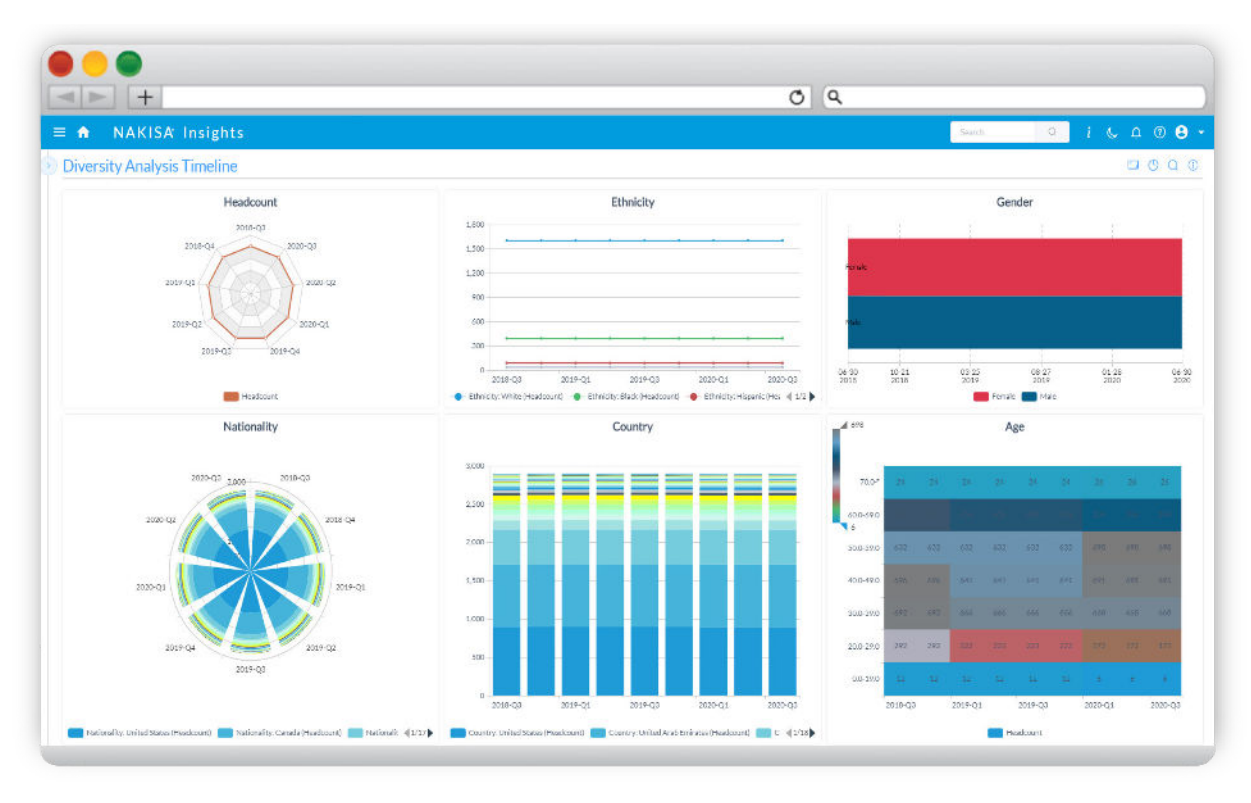
Diversity Analysis Timeline

The solution also allows users to collaborate in real time, model any proposed organizational changes, and share insights with all stakeholders securely to reinforce progress toward goals and improve accountability. Most importantly, Nakisa Hanelly's D&I solution allows leaders to visualize data across multiple organizational structures – all within a single tool.