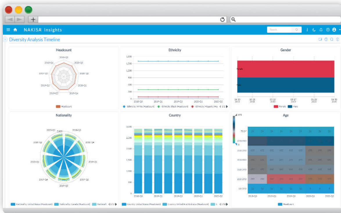
Diversity Analysis Timeline

The solution also allows users to collaborate in real time, model any proposed organizational changes, and share insights with all stakeholders securely to reinforce progress toward goals and improve accountability. Most importantly, Nakisa Hanelly's D&I solution allows leaders to visualize data across multiple organizational structures – all within a single tool.